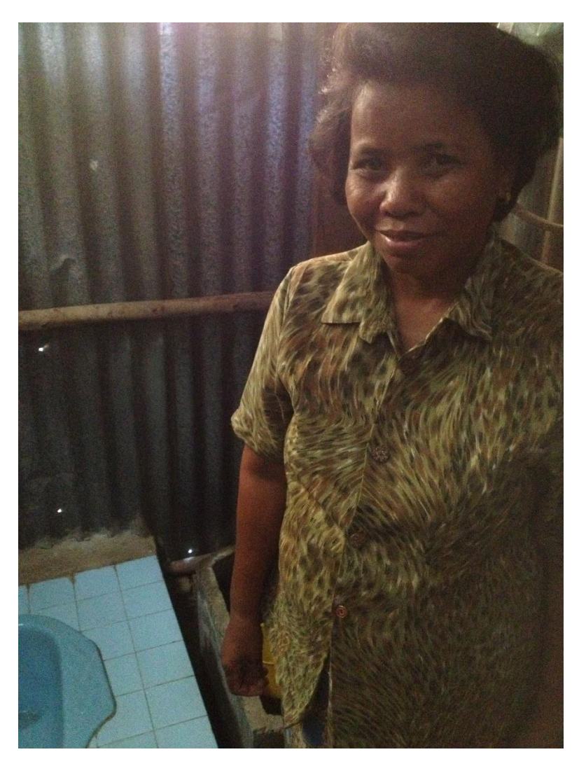
FIGURE 6 LATRINE CONSTRUCTED WITH ASSISTANCE OF A HARDWARE SUBSIDY

While WaterSHED has expressed concern about the dampening effects of introducing subsidies it ran its own small trial in Kampong Speu province, providing a limited number of discount 'vouchers' to poor households in high coverage villages.<sup>58</sup> ID1 households were offered a $20 subsidy voucher and ID2 households $10 and these were only offered in villages that had achieved a sanitation coverage of 80% or more. Two of these households were visited during the evaluation and it was found that the latrines were well constructed and being used. There did not seem to be any negative reactions from other households in the village that had not received subsidies, which indicates that a well designed and implemented subsidy program may assist in moving high coverage communities to 100% coverage.