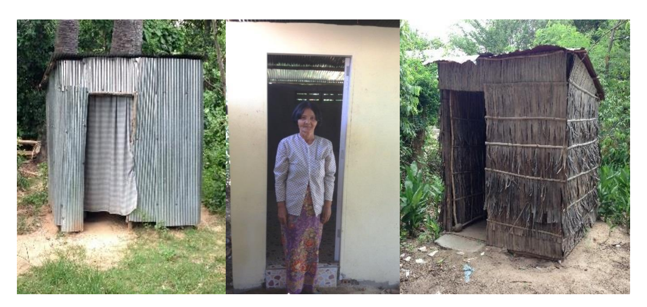
FIGURE 5 DIFFERENT STYLES OF LATRINE SHELTER

view was that having the funds to build a good shelter was the critical factor. The RCSAS study affirmed that while there were delays to installation, almost all latrines are eventually installed suggesting that the measures WaterSHED has adopted to address this issue have largely been successful.<sup>55</sup>