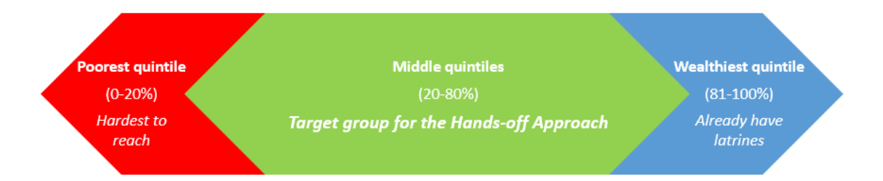
FIGURE 3 WEALTH QUINTILES AND THE HANDS-OFF APPROACH

Broadly, the market for sanitation in a rural Cambodian village after an initial marketing drive can be divided into three groups—existing latrine owners, early adopters, and non-adopters. Sanitation marketing programs have found that there are usually some households in a community that already own and use a latrine and that when the sanitation marketing program begins there are a number of 'early adopters' who quickly respond to marketing. Achieving total coverage is more difficult, as the remaining households ('laggards' in marketing terms) say they can't afford to buy the product or are resistant to changing their behaviour. WaterSHED's program works most readily with the middle quintiles, and these are generally described by WaterSHED as their target group (Figure 3).