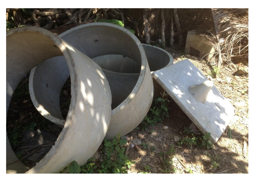
FIGURE 4 CORE LATRINE COMPONENTS AWAITING INSTALLATION

WaterSHED is working on the development of more affordable latrine shelters (as are other sanitation marketing agencies, iDE and WTO) to minimise installation delays and increase sales to poorer households. Three potential models are currently being trialled at price points of around $200-300 but none have yet gone to market.<sup>51</sup> In 2015 WaterSHED's shelter design team was selected as finalists in the American Society of Mechanical Engineers (ASME) design competition, and WaterSHED plans to bring a desirable and affordable shelter to market sometime in 2016.<sup>52</sup>